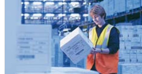
B-SX4 & B-SX5