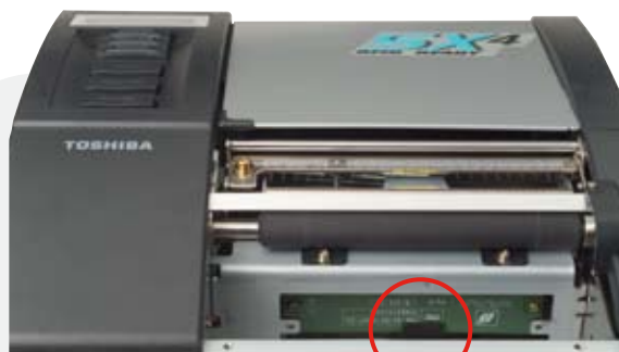
UHF RFID antenna